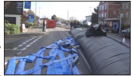
Aquadam isolating houses on north Bridge Road, Chertsey.

Every effort should be made to ensure the early implementation of the River Thames Scheme (RTS) for Flood Alleviation from Datchet to Teddington. SCC & Local Authorities (eg RBC etc) should lobby strongly to change the formula used by DEFRA to take greater cognisance of the disruption to local businesses and damage to the transport infrastructure. This would allow Central Government to allocate more to the RTS and reduce the shortfall. The £256 million scheme ( 2009 price), at present has a short fall of approximately £120 million. In addition SCC & Local Authorities should make provision to fund the short fall over a 10 year period or actively seek third part income. It should be recognised that the lower part of Channel 2 of the RTS connects Thorpe Lakes with the River Thames on the north side of the M3 Motorway across the Burway Meadow. This channel would take the excess flood water from The Chertsey Bourne and The Abbey River and would thus prevent flooding in Chertsey town centre.