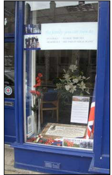
Display in Lodge Bros. window