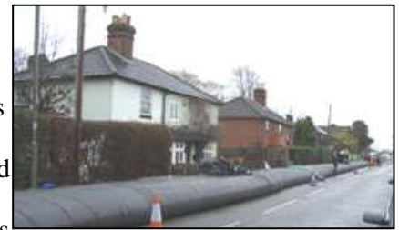
East end of Aquadam near Chertsey Bridge 'The Chertsey Sausage'